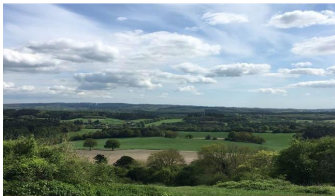
View of the Surrey Hills from the North Downs, near Guildford