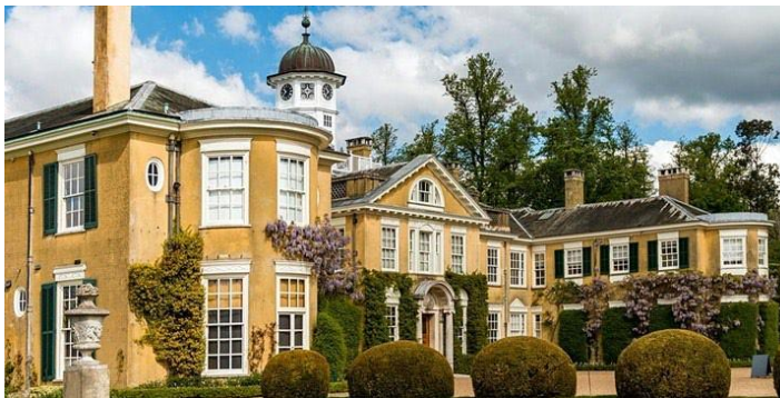
Polesden Lacey house and gardens, Great Bookham, near Guildford