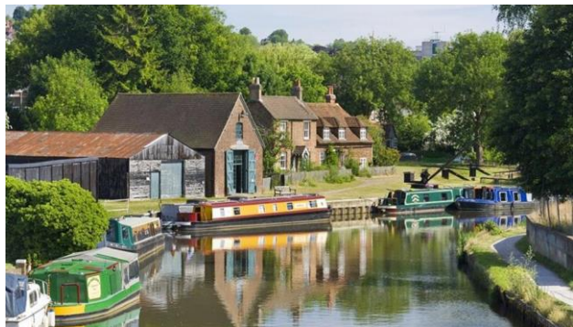
Dapdune Wharf, River Wey & Godalming Navigations, Guildford

Britain Tourist Information: visitbritain.com/gb/en